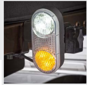
Long-life LED light