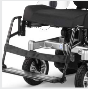
Reinforced components ensure great stability