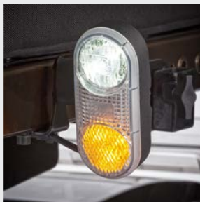
Long-life LED light