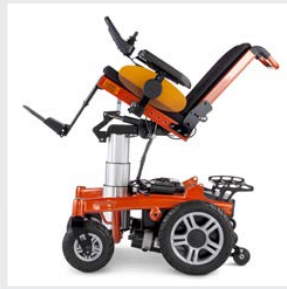
200 mm seat lift, tilt-in-space