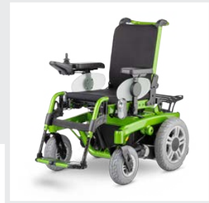
Frame colour green