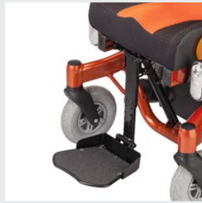
Central leg support, 90° knee angle