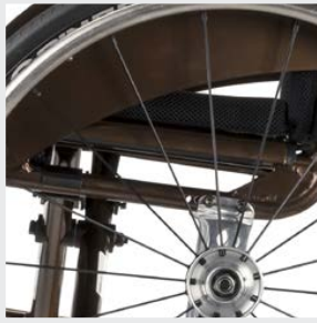
Characteristics of a fully welded wheelchair