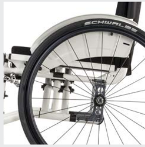
Characteristics of a fully welded wheelchair