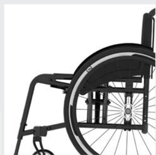
Smooth transition from front frame to seat