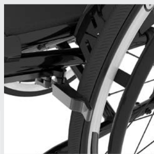
Innovative, "Light" brakes made of aluminium and swivel-mounted